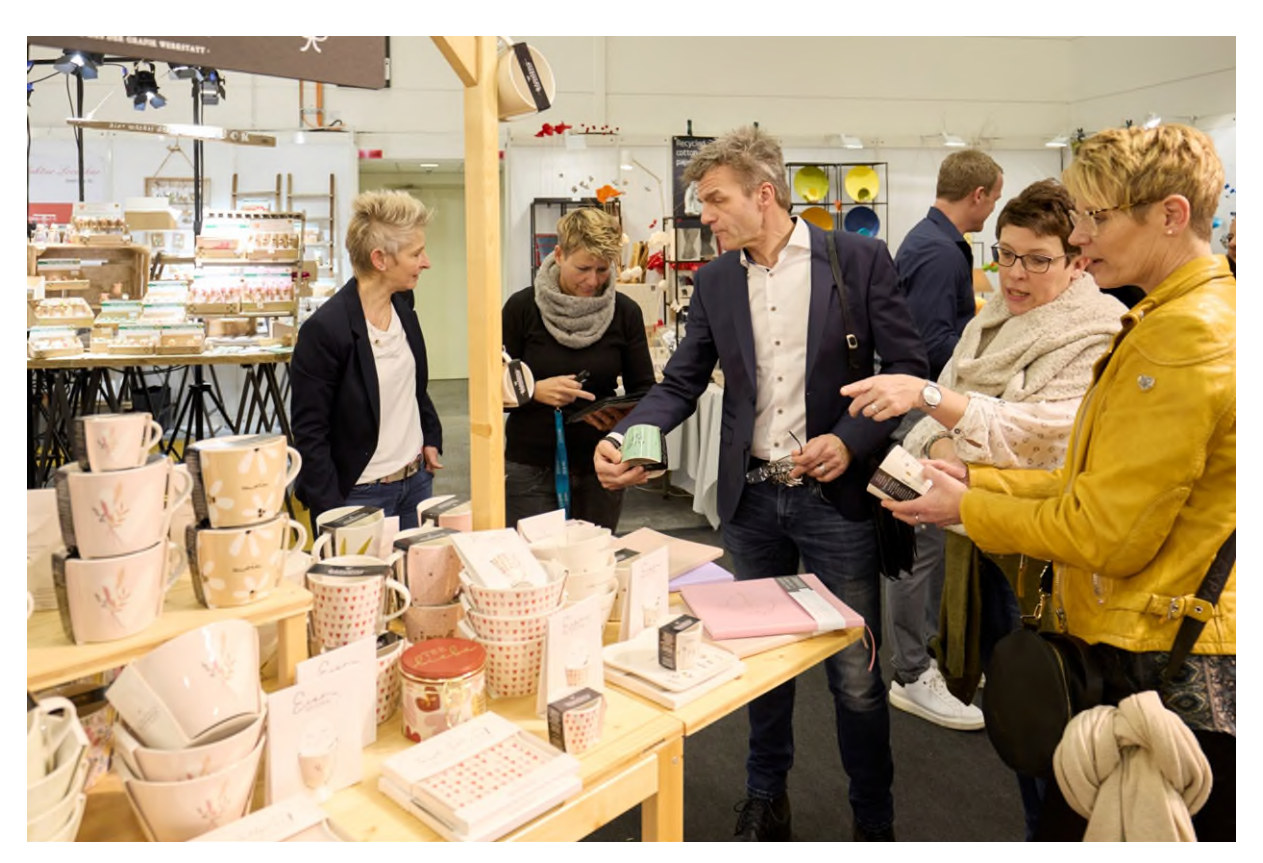
The anniversary edition of Nordstil was characterised by a lively industry exchange and a good ordering mood.

Frankfurt am Main, 15. January 2024. A large number of exhibitors and visitors, a wealth of new products for the coming seasons and a good ordering mood characterised the anniversary edition of Winter Nordstil: 752 exhibitors from Germany and abroad met around 13,500 buyers¹ who were inspired by product worlds of new quality and variety. The Nordstil Forum provided practical expert knowledge to equip buyers for challenging times. The fringe programme focused on the newly introduced sustainability programme Ethical Style, trends at the PoS, best-practice examples to combat the shortage of skilled workers and tips on digital presence and provided answers to current questions in the industry.